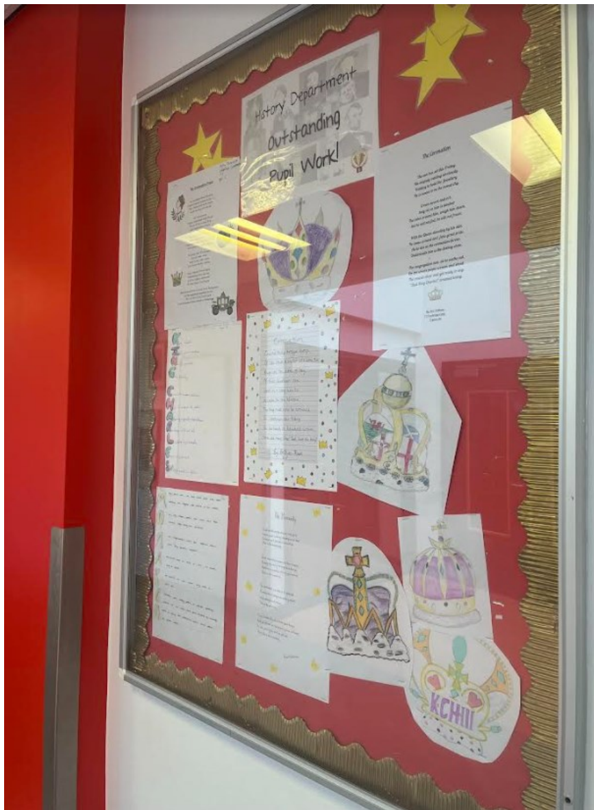
The History Department

Well done to all pupils in Year 7 and 8 who produced excellent Coronation work recently to enter in the local competition at the Town Hall. Pupils were tasked with designing a new crown or mode of transport for King Charles or even writing a poem to commemorate his Coronation. All pupils worked hard to produce these and a selection